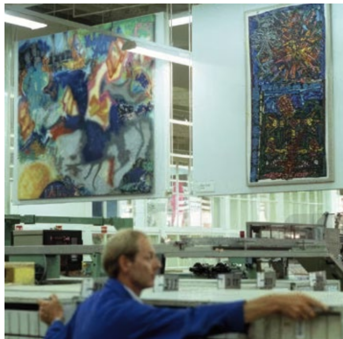
Interior of the Peter Stuyvesant factory in Zevenaar with works by Toxic and Robert Combas