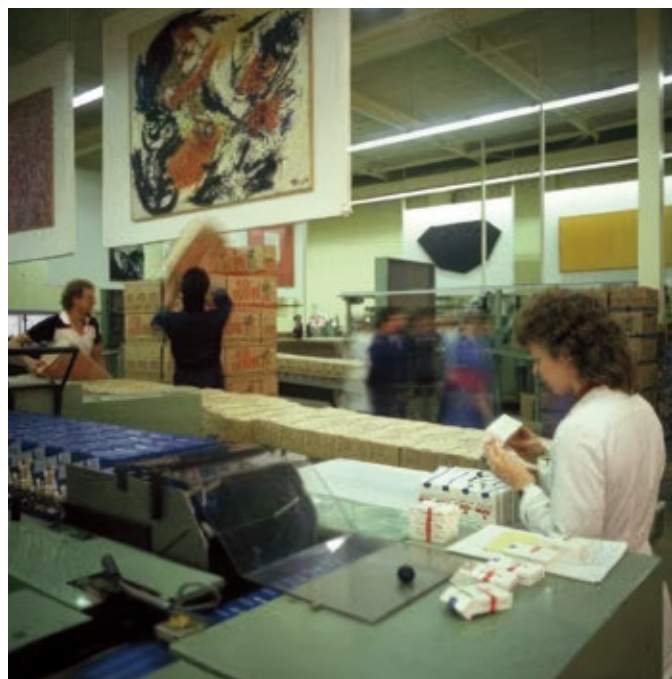
Interior of the Peter Stuyvesant factory in Zevenaar with works by Karel Appel, Kenneth Noland, and Robert Mangold