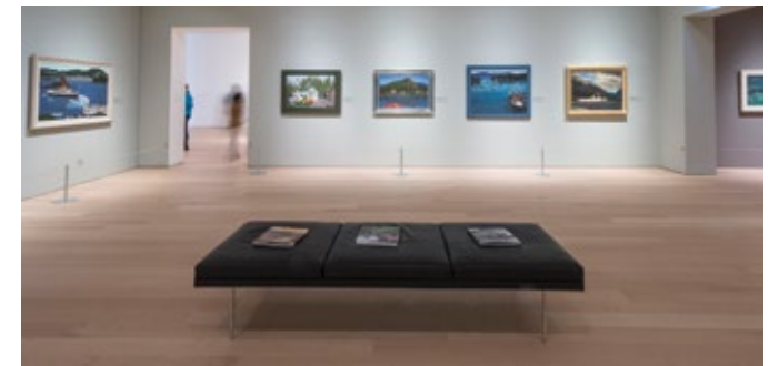
Installation views of E.J. Hughes and Depictions of Place at the Audain Art Museum, Whistler, BC