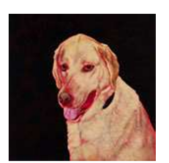
212 DANA HOLST

Preview at: Heffel – 13 Hazelton Ave Toronto