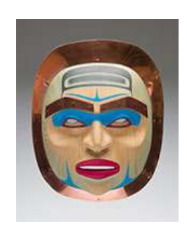
101 KLATLE -BHI 1966 - Canadian Indigenous