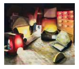
327 ETIENNE ZACK 1976 - Canadian

Preview at: Heffel – 13 Hazelton Ave Toronto