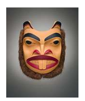
TITUS AUCKLAND 1966 - Canadian Indigenous