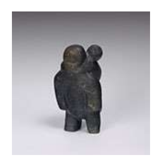
201 BARNABUS ARNASUNGAAQ