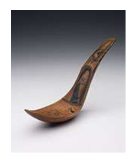
105 FREDERICK ALEXCEE