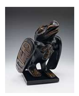
115 TOM ENEAS