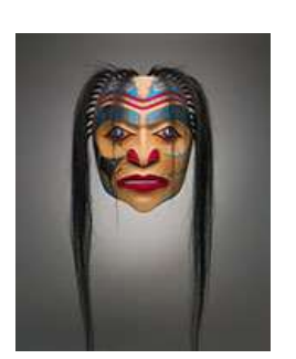
102 KLATLE -BHI 1966 - Canadian Indigenous