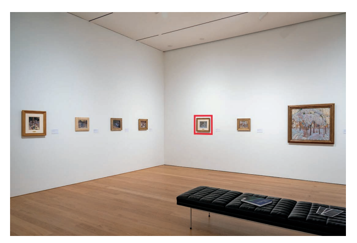
Installation views of Tom Thomson: North Star, Audain Art Museum, Whistler, BC, 2024, with Winter Morning indicated