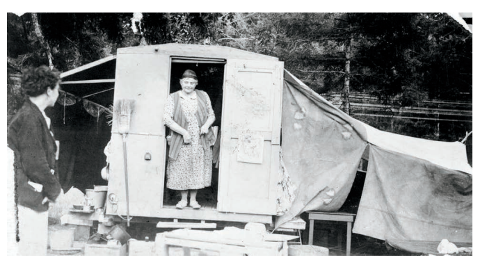
TOP: FIGURE 4: EDYTHE HEMBROFF-SCHLEICHER Self-Portrait with Emily Carr