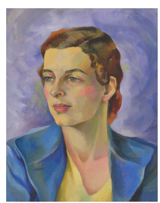
TOP: FIGURE 2: EDYTHE HEMBROFF-SCHLEICHER Portrait of Emily Carr

oil on canvas, 1932 Collection of the Vancouver Art Gallery Not for sale with this lot