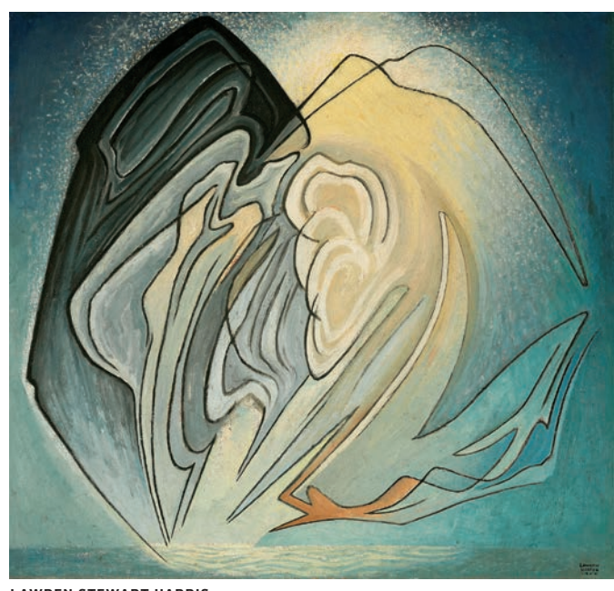
LAWREN STEWART HARRIS Abstract Painting

Glenbow Museum, Calgary, The Group of Seven in Western Canada , July 13 - October 14, 2002, traveling in 2002 -