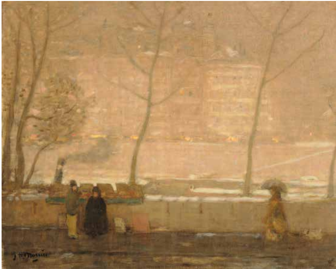
FIGURE 1: JAMES WILSON MORRICE Quai des Grands-Augustins oil on canvas, 1904 25 1/4 x 31 1/2 in, 65 x 80 cm Collection of Musée d'Orsay, Paris, RF1980-146