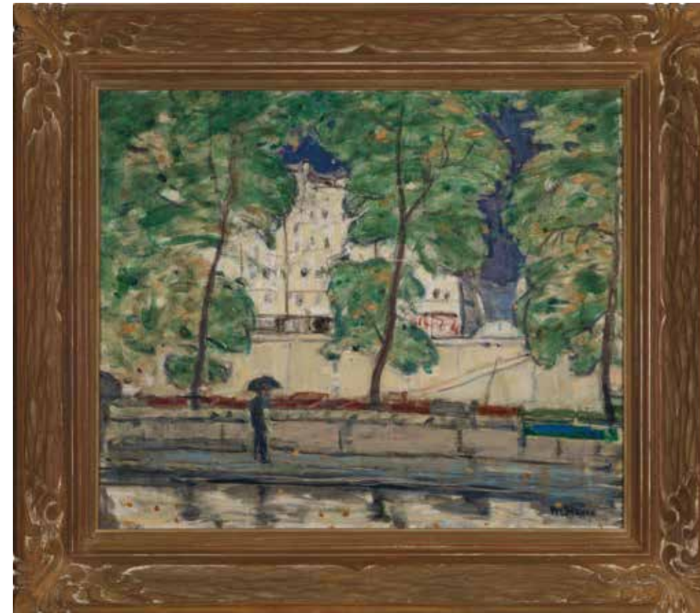
114 showing in its frame

When I arrived at my studio I found a most ghastly change—the shop next door is now an automobile shop—it is painted red—a beastly hot red—what one would naturally expect... At night there is a huge lantern with a large number & the